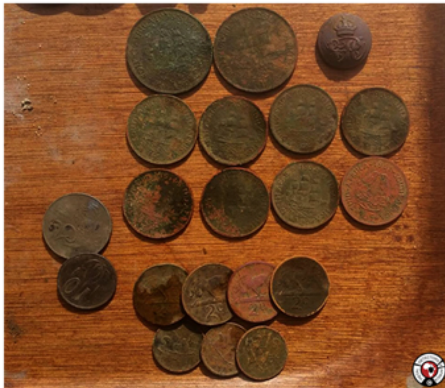
Variety of older South African Coins found with the Nokta IMPACT.

is bottle top and pull tabs heaven but I knew that if the Impact was in fact going to replace my Racer 2 it was going to have to prove itself and make an "IMPACT".