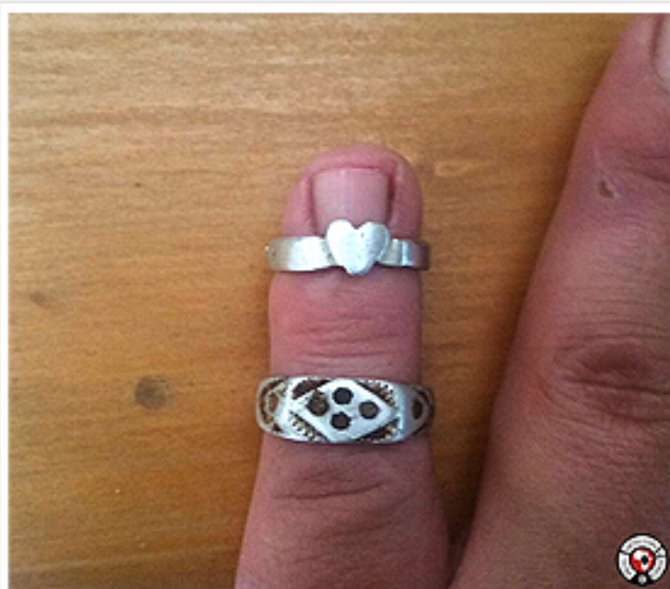
Beautiful Silver Ring Finds with the Nokta IMPACT Detector.

I could not be more impressed with its performance and looking at all the features the Impact presents I am sure every detectorist will find a useful purpose for this detector.