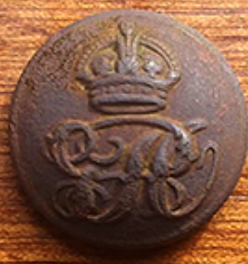
Old British General Post Office button found with the Nokta IMPACT.

Depth is certainly not an issue for the Impact but what really stood out for me was the clear audio on those deep items. It was like being at a candy store and knowing what to listen for I was also rewarded with a early 1900's General Post office button and also 2 silver rings.