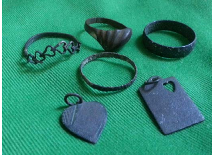
Old silver items found with Racer 2 on one hunt

When doing a hunt on a dry sand area I found that the Racer 2 have excellent depths and I sometimes have to dig about 25cm-30cm to retrieve the smallest of items . I prefer 3 tone mode as this is the mode I primarily use when doing inland hunting. It gives me enough detail about the items I am about to dig and the depth like stated previously is great . I have even been lucky enough to retrieve a Platinum ring weighing 8.1grams from this dry sand area which in my book is a bucket list item. I could not be more happy with our relationship and I would certainly say this detector finds the goods.