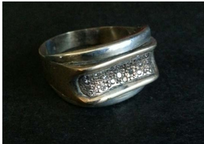
9ct Gold and Silver ring found with Racer 2

I decided to do a few solo hunts and this certainly proved to be more difficult until I found an incredible 9ct gold and silver ring with diamonds , weighing 13.7grams