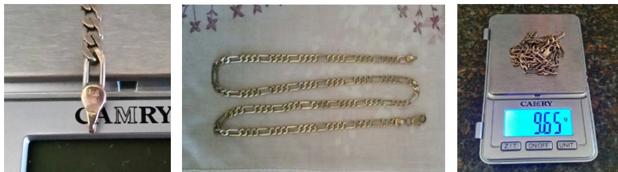
Very thin 9ct gold necklace found with Racer 2

This machine does it all, you just need to learn its language and understand how she needs to be treated to get the best results, in other words adjust settings if need be or understand that any machine will give some chatter on heavy mineralized black sand/soil but resolving this is simple. Doing a ground balance and adjusting its gain will fix this issue and you will soon be finding the treasure on these sweet spots or simply switch to beach mode and have a silent sniper with no interference. It's basically come down to preference of choice and this machine gives you those options. It might even surprise you with the very elusive thin 9ct gold chain. I certainly was surprised and again very happy with my purchase.