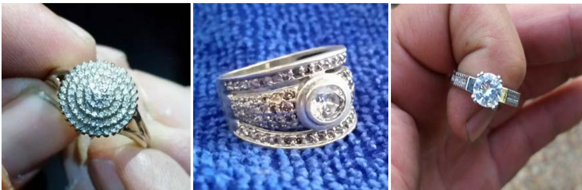
Varies rings found with Racer 2

I have also been very successful in finding other rings consisting of different metal types such as silver, bronze, copper and aluminum proving that the Racer 2 doesn't leave anything behind , it lets you choose if you want to dig the item or venture on to the next but I also have to say understanding and knowing what your detector is telling you is of up most importance , fortunately for us , learning that language with the Racer 2 is very easy.