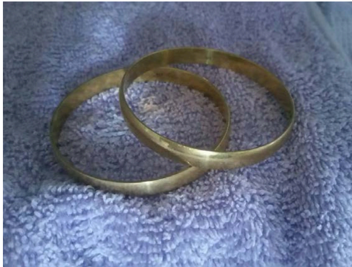
9ct Gold Bangles found 15cm apart with Racer 2

The Makro Racer 2 has 5 different modes as previously stated on a first review of the detector. When hunting beaches I primarily use three modes. These are my preferences and by no means am I saying anyone should use or follow these modes for hunting beaches but they do work for me. For dry and wet sand I use 2 tone or 3 tone mode depending on conditions and areas I want to detect, I do find that 2 tone give a little more depth but 3 tone gives me more detail on the items in the ground and I can filter through trash and good solid signals with ease... The Racers 2 is a master at separation and cherry picking good solid reputable tones always produce as can be seen with these 2 x 9ct Gold Bangles found about 15cm apart on a fairly trashy beach.